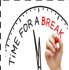
RELAX TAKE A BREAK