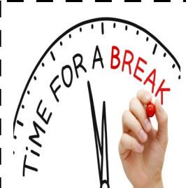
RELAX TAKE A BREAK