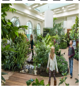
THE BUTTERFLY ATRIUM